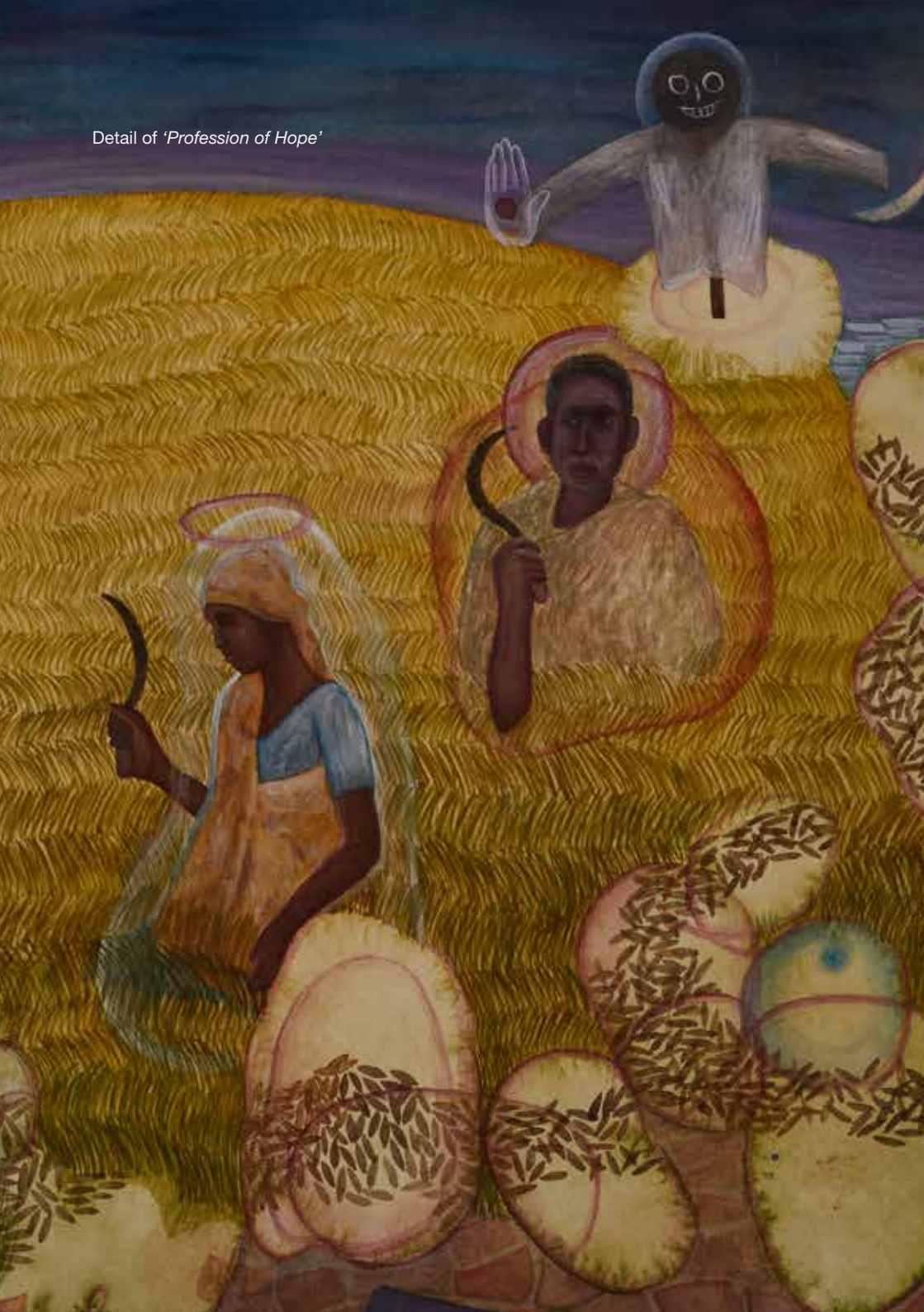
Detail of 'Profession of Hope'