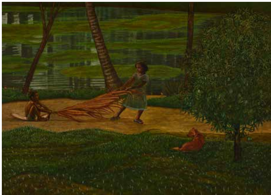
Glimpses of the Rare Watercolour on paper 11.61 x 16.53 in. (29.5 x 42 cm.) 2021, Kolkata Signed in English (reverse)