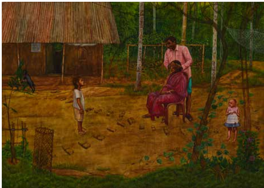
Album: Convalesce Watercolour on paper 11.61 x 16.33 in. (29.5 x 41.5 cm.) 2021, Kolkata Signed in English (reverse)