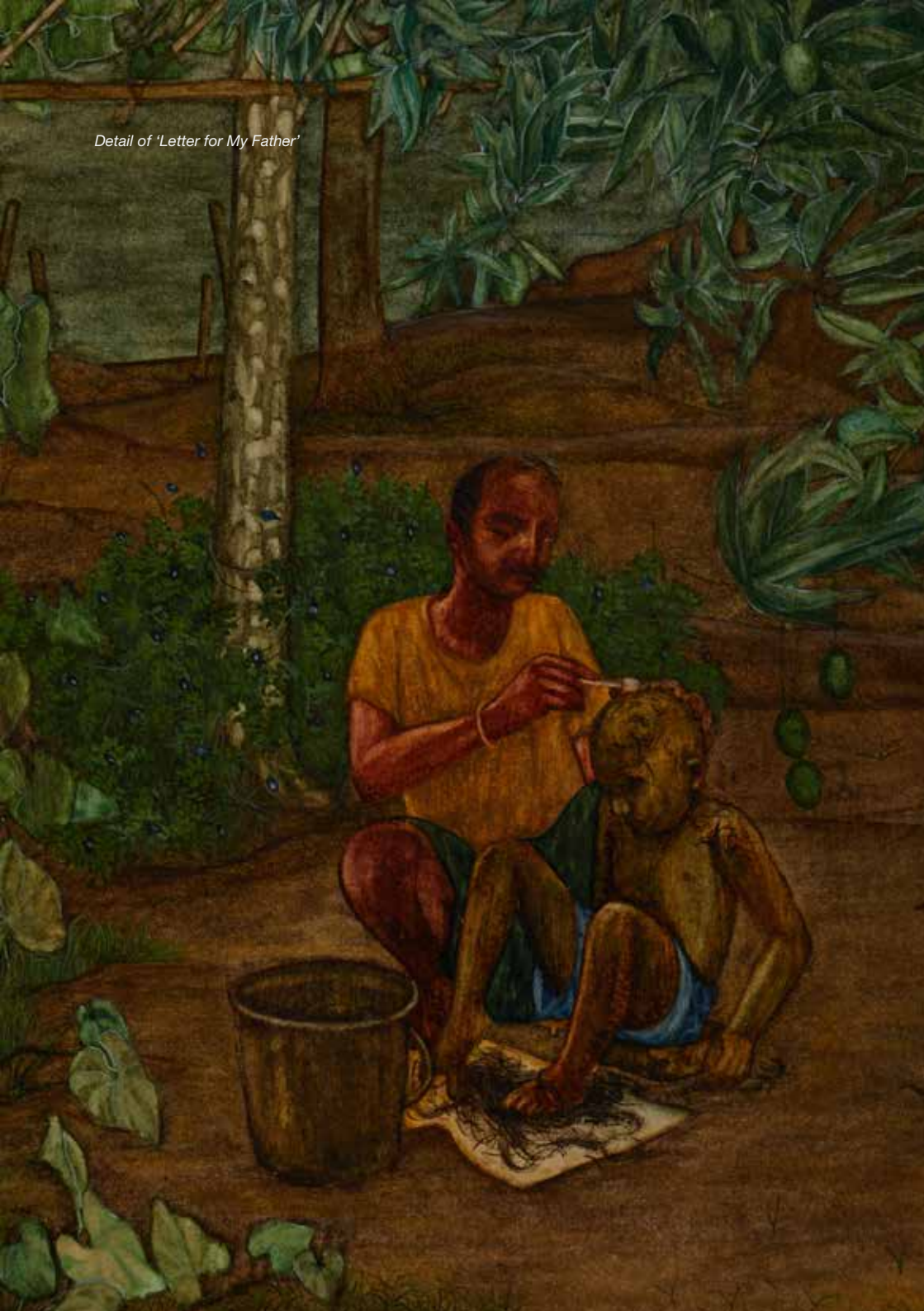
Detail of 'Letter for My Father'