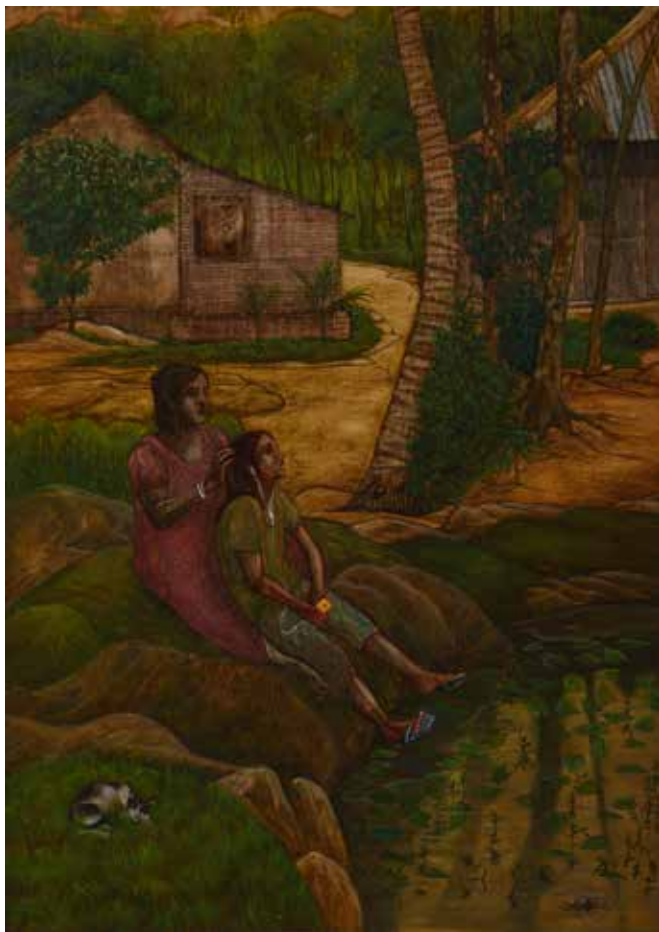
Serene Greenery Watercolour on paper 16.53 x 11.81 in. 2021, Kolkata Signed in English (reverse)