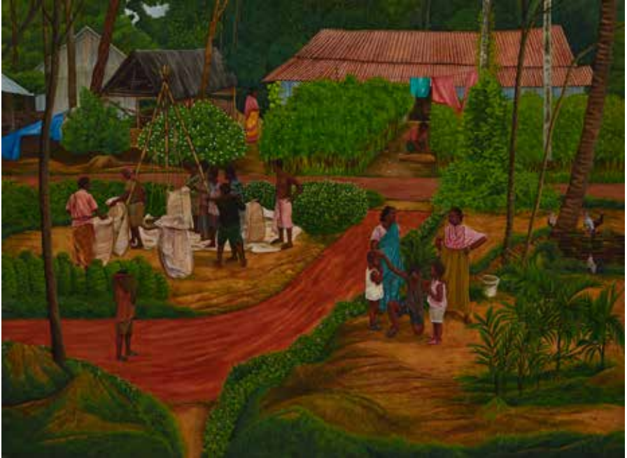
Palli Watercolour on paper 22.04 x 29.92 in. (56 x 76 cm.) Undated, Kolkata Unsigned