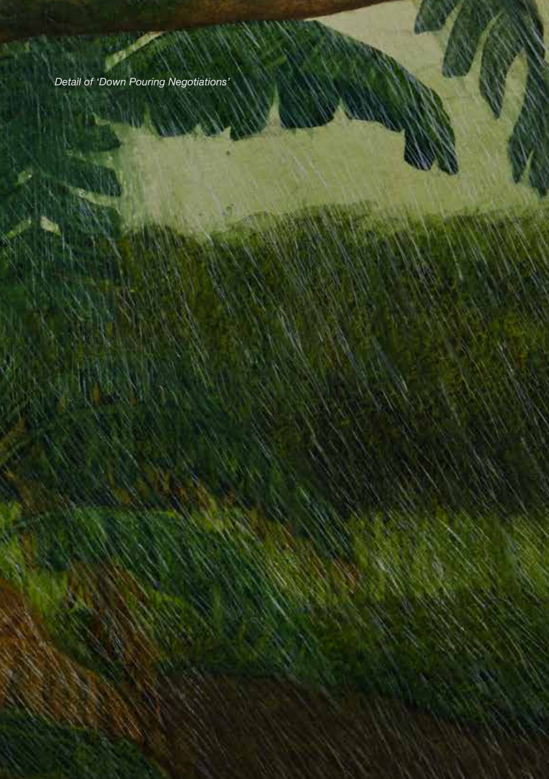
Detail of 'Down Pouring Negotiations'