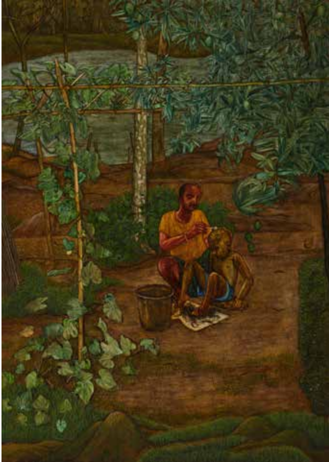
Letter for My Father Watercolour on paper 16.53 x 11.61 in. 2021, Kolkata Signed in English (reverse)