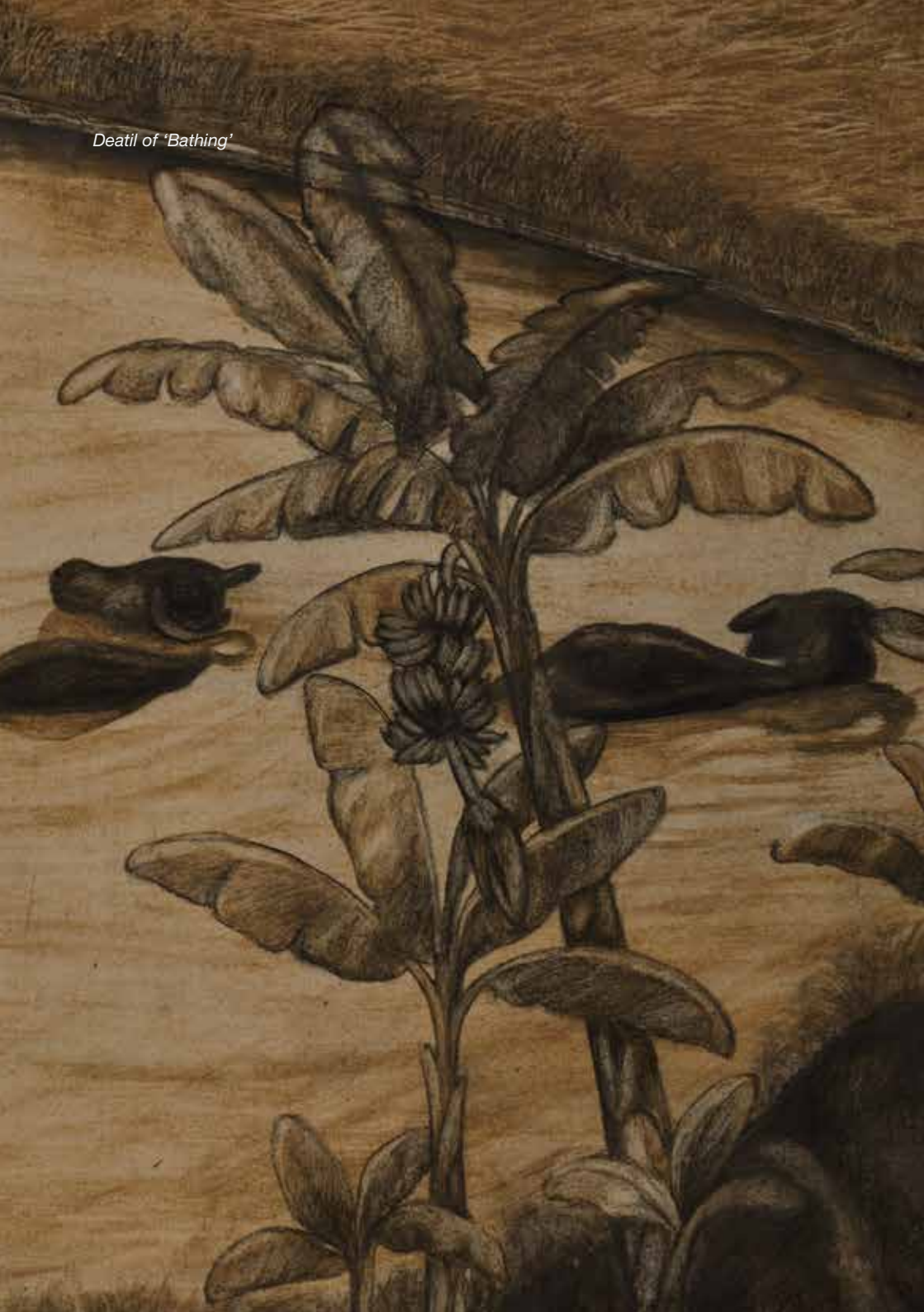
Detail of 'Bathing'