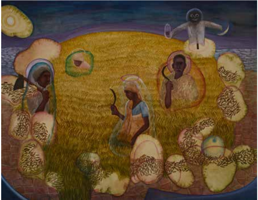
Profession of Hope Watercolour on paper 10.82 x 13.77 in. (27.5 x 35 cm.) 2020, Kolkata Signed in English (reverse)